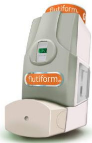
FLUTIFORM MDI (Fluticasone prop/formoterol)