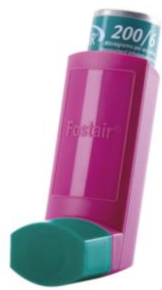
FOSTAIR MDI (Beclometasone/ formoterol)