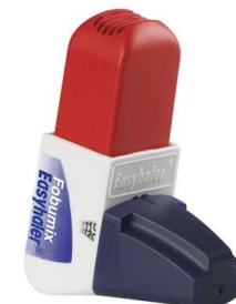
FOBUMIX EASYHALER DPI (Budesonide/ formoterol)