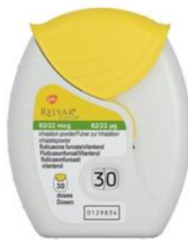
RELVAR ELLIPTA DPI (Fluticasone furoate/vilanterol)