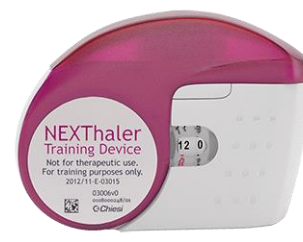
FOSTAIR NEXTHALER DPI (Beclometasone/ formoterol)